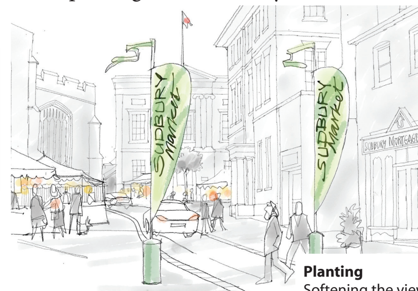
View of new Market entrance from King Street

Planting Softening the view with pleached trees in planters